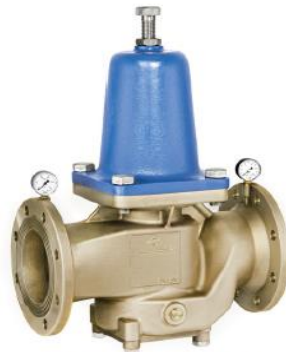
DRV 602 • DRV 608 DN 65 - DN 150