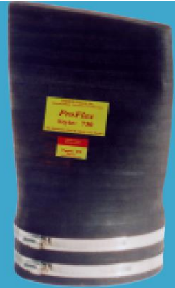
Table 3: Sizes • Weights